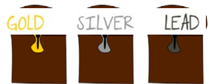
The Merchant of Venice