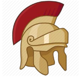
Troilus & Cressida