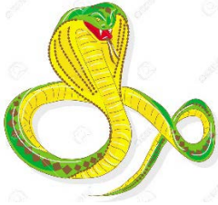
Anthony & Cleopatra